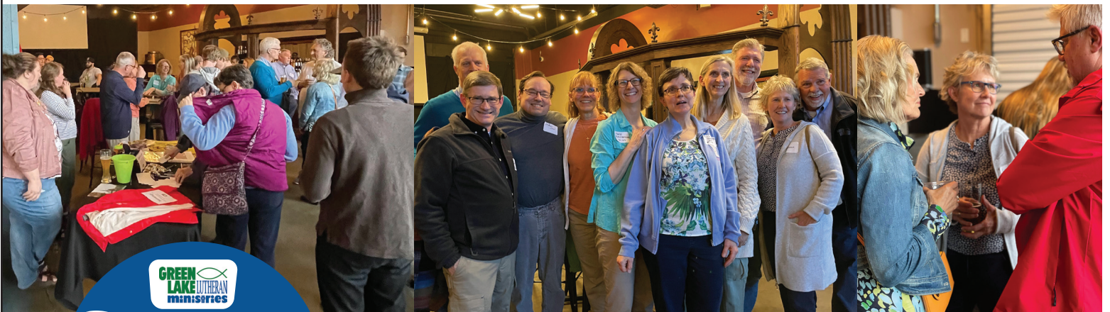
Above: May 2023 Staff Alumni Gathering at Utepils Brewing Company, Minneapolis