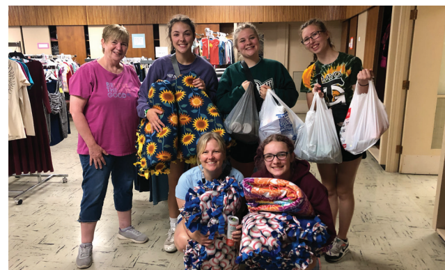
Blankets for local unsheltered, sheltered, or people in transitional housing situations in Milwaukee, Nashville, and Chicago.

Learn more about how you can use your Thrivent Action Team grants with GLLM ministries at www.gllm.org/thrivent