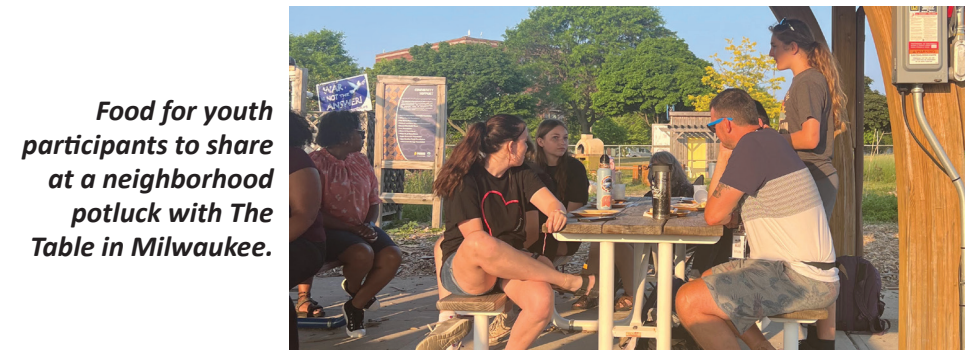
Food for youth participants to share at a neighborhood potluck with The Table in Milwaukee.